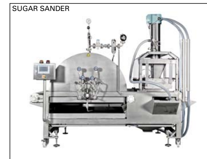
SUGAR SANDER Our high-quality sugar sanders stand for even distribution and great bonding of the sugar coating; they are easy to clean and fully automated. The extruded product is guided onto a vibrating bed of sugar, while simultaneously a curtain of fresh sugar is dropped from the top over the product. The excess sugar is collected and recycled.