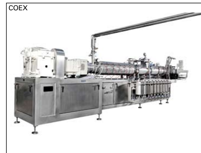
COEX Extrufood is an expert in extrusion and co-extrusion technology. The most important advantage of extrusion is a more homogenous and consistent cooking process which leads to a final product of a consistently higher quality. Extrufood has three types of extruders: cooking, mixing and forming extruders.