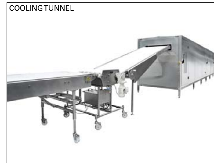
COOLING TUNNEL Extrufood manufactures single and multi-tier deck cooling tunnels that cool and condition the extruded product to room temperature in the most efficient manner. All Extrufood cooling tunnels are tailor made to customer specifications.