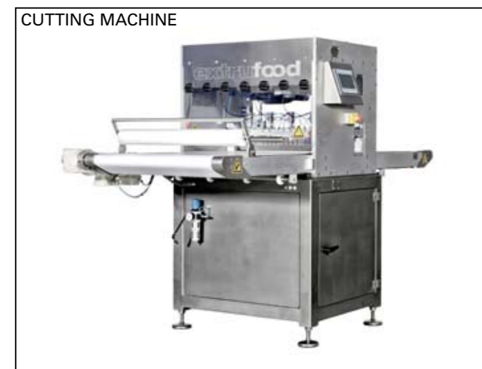
CUTTING MACHINE The characteristic features of our modern design are reliability, ease of cleaning, maintenance and extremely accurate cutting. Our cutting machines feature knife travel synchronized with the belt speed, therefore ensuring a clean and vertical cut. The capability of cutting speeds of up to 600 cuts per minute.