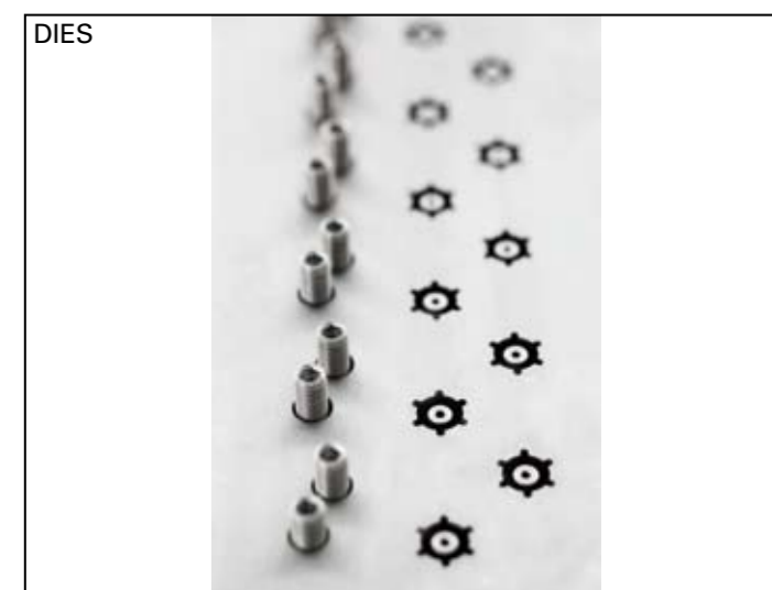
DIES Extrufood designs and manufactures state of the art dies, enabling production of licorice with almost endless possibilities for combinations of colors, shapes and textures; twisted or non-twisted, filled, solid or hollow.