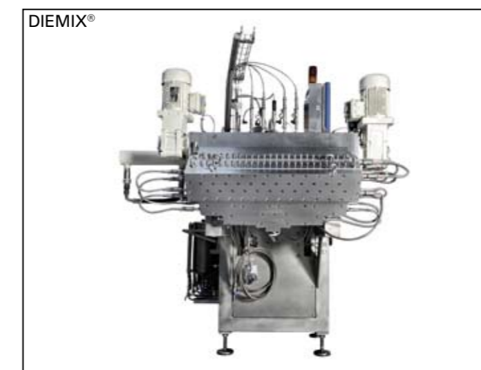
DIEMIX® A Diemix® enables the production of licorice and/or sugar paste with up to 6 different colors simultaneously while using only one extruder.