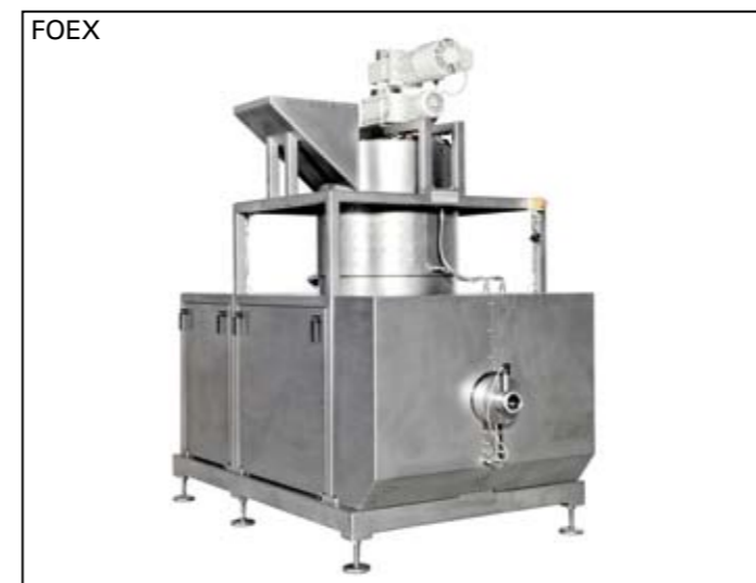
FOEX The Forming Extruder is especially designed to build up sufficient pressure, for example to make a sugar paste co-extrusion product.