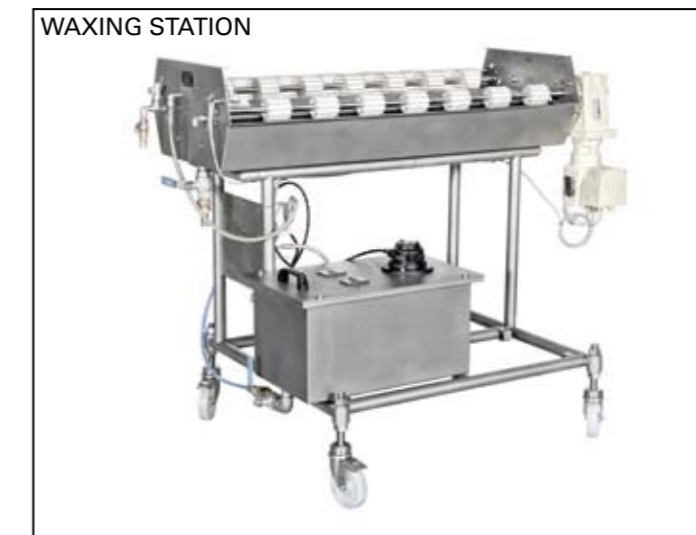
WAXING STATION The waxing station coats the final product to enhance presentation, to prevent the product from sticking and to help retain moisture inside the packed product.